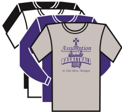
White, Black, Navy or Ash Long-Sleeve or Short Sleeve T-Shirt - Screen Printed

Youth: Small 6-8, Medium 10-12, Large 14-16 Adult: Small - 3XL (Add $2.00 for 2X, Add $3.00 for 3X)