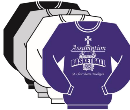
Oxford, Black, White or navy Crew Neck Sweatshirt - Screen Printed

Youth: Small 6-8, Medium 10-12, Large 14-16 Adult: Small - 3XL (Add $2.00 for 2X, Add $3.00 for 3X)