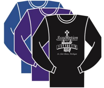
Royal, Navy or Black Long-Sleeve Performance Tee - Screen Printed

Youth: Small 6-8, Medium 10-12, Large 14-16 Adult: Small - 3XL (Add $2.00 for 2X, Add $3.00 for 3X)