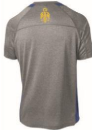
Includes Back Hang Tag Print