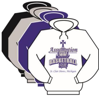
White, Black, Navy or Ash Hooded Sweat Shirt - Screen Printed

Youth: Small 6-8, Medium 10-12, Large 14-16 Adult: Small - 3XL (Add $2.00 for 2X, Add $3.00 for 3X)